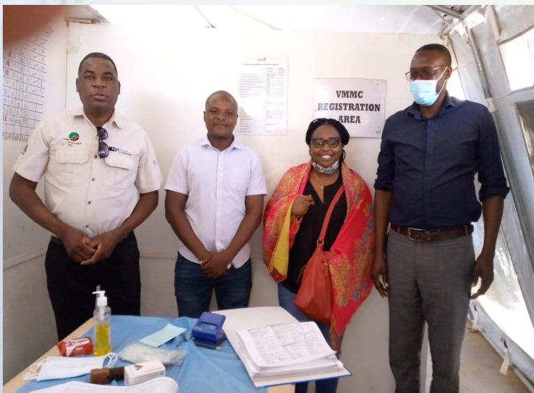
With MC provider at Chibolya RHC in Katete - MC room 28 Oct'21

Some of the areas for improvement which were identified include LiB combination, documentation, client segmentation, certification of trained ShangRing MC providers, resumption of ShangRing services once CIDRZ distributes the Supplies TA (including ShangRing) by early December 2021, HCD training & EPHO purchase of additional ShangRing supplies by end of Q2FY22.