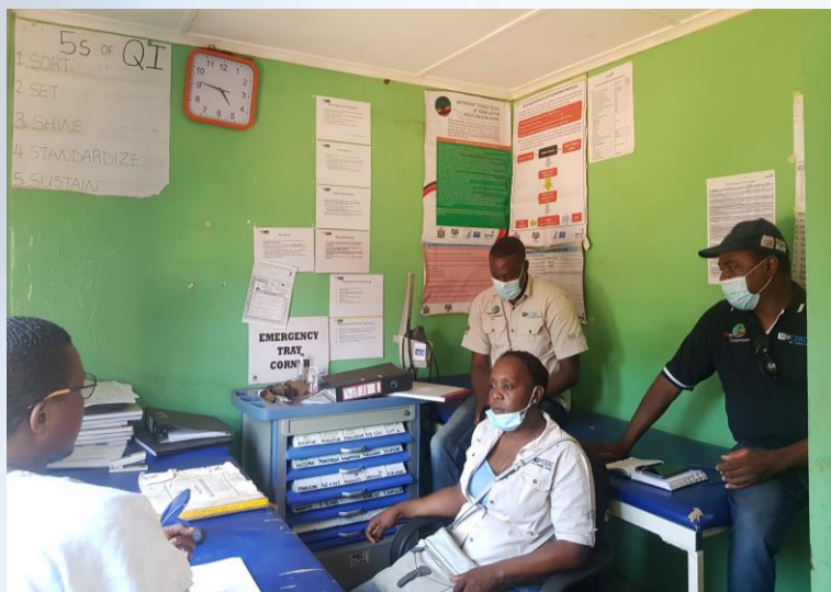
:Nyimba district hospital MC room on 29 Oct'21