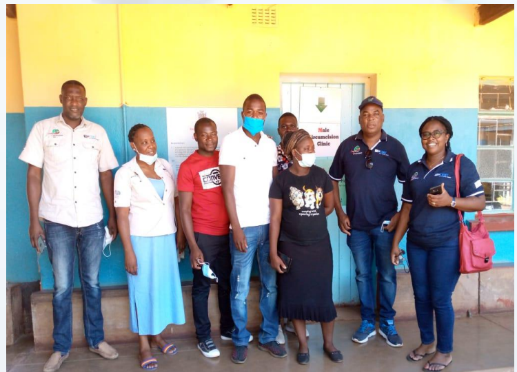
Posing for a photo with the MC team at Petauke District Hospital on 28 Oct'21