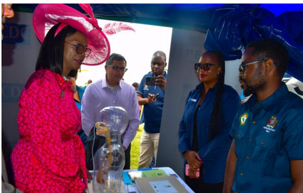
Hon. Masebo at the CIDRZ stand.

In a poignant celebration of World AIDS Day at the Olympic Youth Development Centre (OYDC) Zambia - Sports Development Centre, CIDRZ proudly stood in solidarity with the global community, highlighting its impactful work and fostering meaningful engagement with the local community.