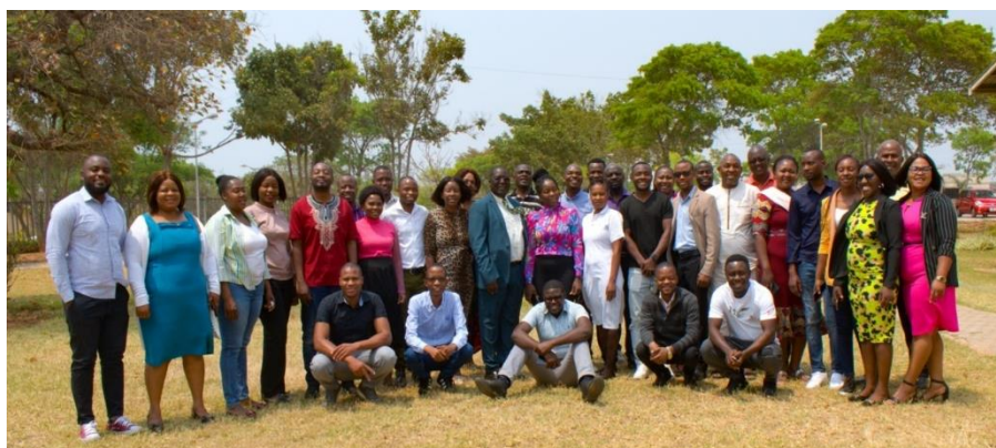
Participants pose for a photo.