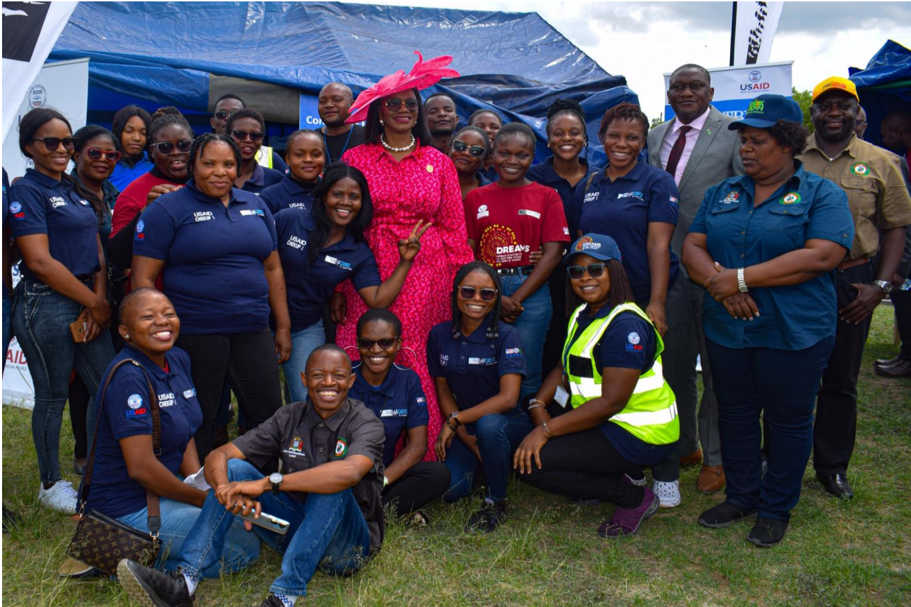
Minister of Health Honourable Sylvia Masebo poses for a photo with CIDRZ staff and selected officials during the commemoration of the World AIDS Day in Lusaka

In a poignant celebration of World AIDS Day at the Olympic Youth Development Centre (OYDC) Zambia - Sports Development Centre, CIDRZ proudly stood in solidarity with the global community, highlighting its impactful work and fostering meaningful engagement with the local community.