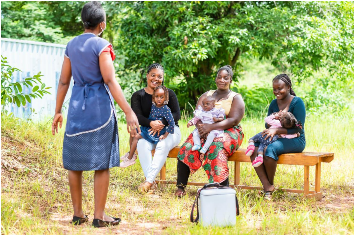
A health Worker having a health talk with young mothers.