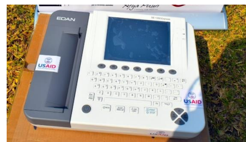
One of the donated ECG machines.