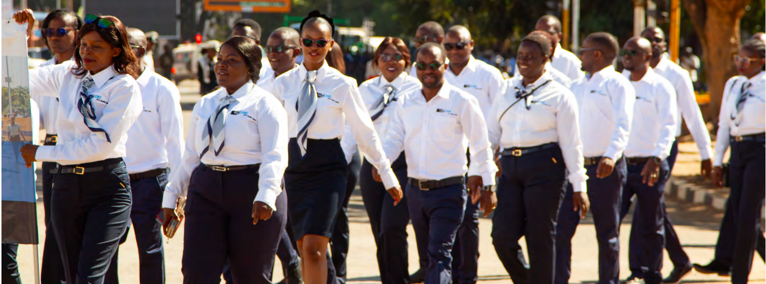
CIDRZ staff during the match-past at the commemoration of Labour Day in Kitwe