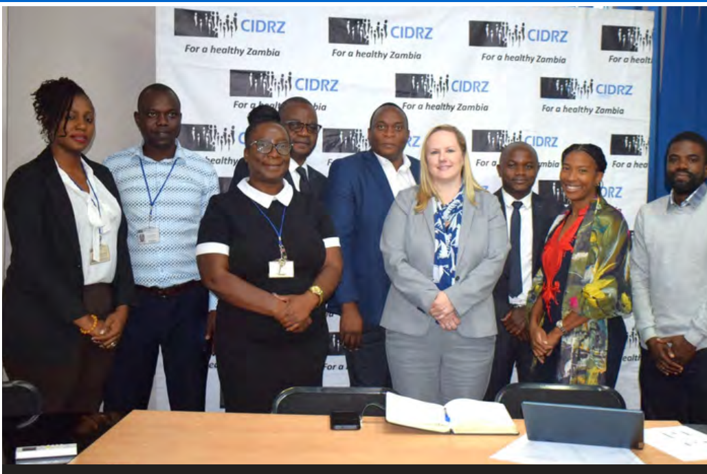
Participants from CIDRZ, MOH, CDC and National TB and Leprosy Program pose for a photo during the presentation of the findings