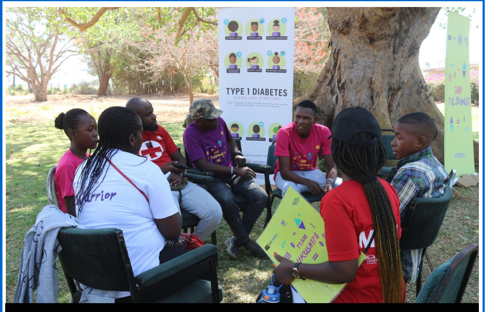
Type 1 diabetic patients during a Diabetes Boot Camp in Chibombo