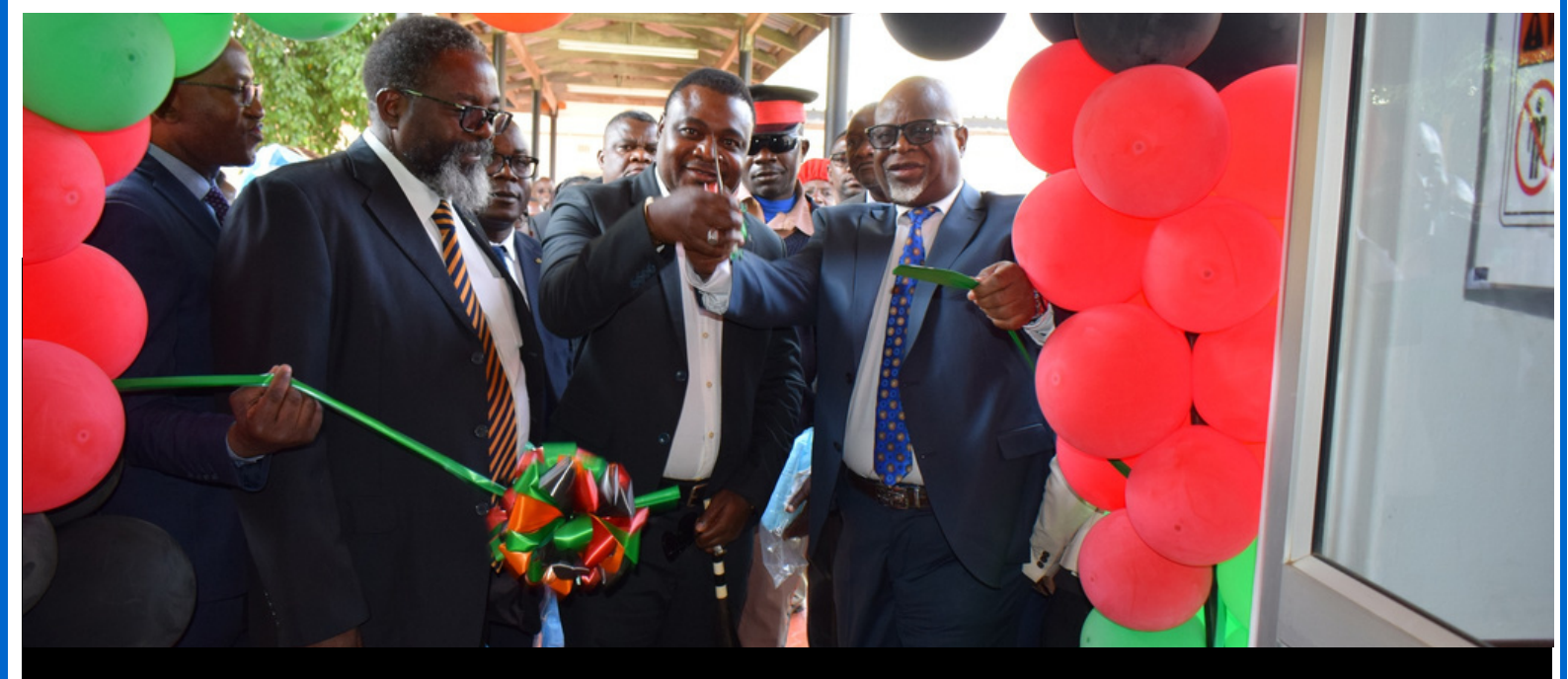
Health Minister Dr Elijah Muchima launches the NMPDP Programme