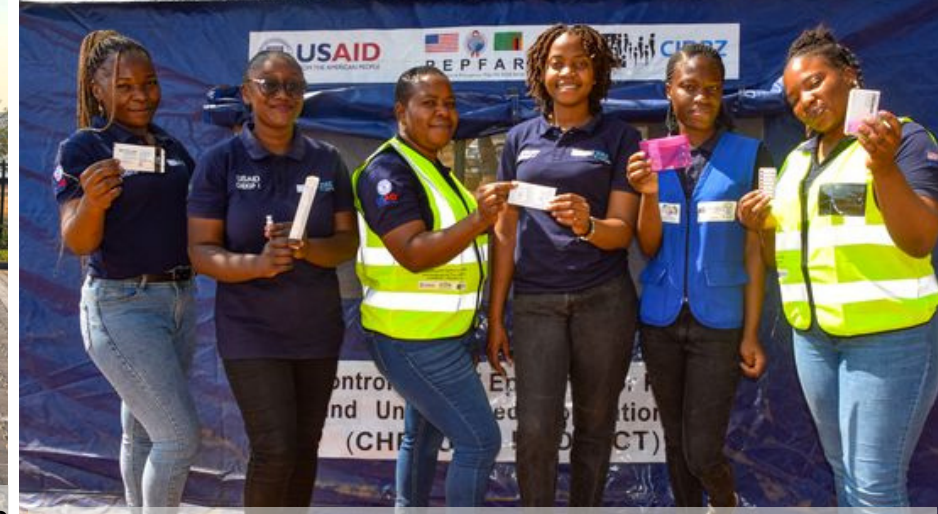
CIDRZ's DREAMS team during the commemoration of World Contraception Day