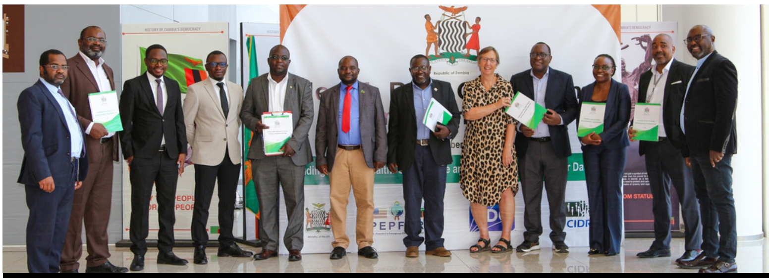
CIDRZ team and various stakeholders during the launch at Mulungushi International Conference Centre