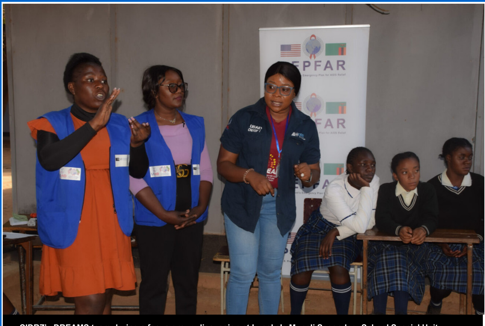
CIDRZ's DREAMS team during a focus group discussion at Lusaka's Munali Secondary School Special Unit