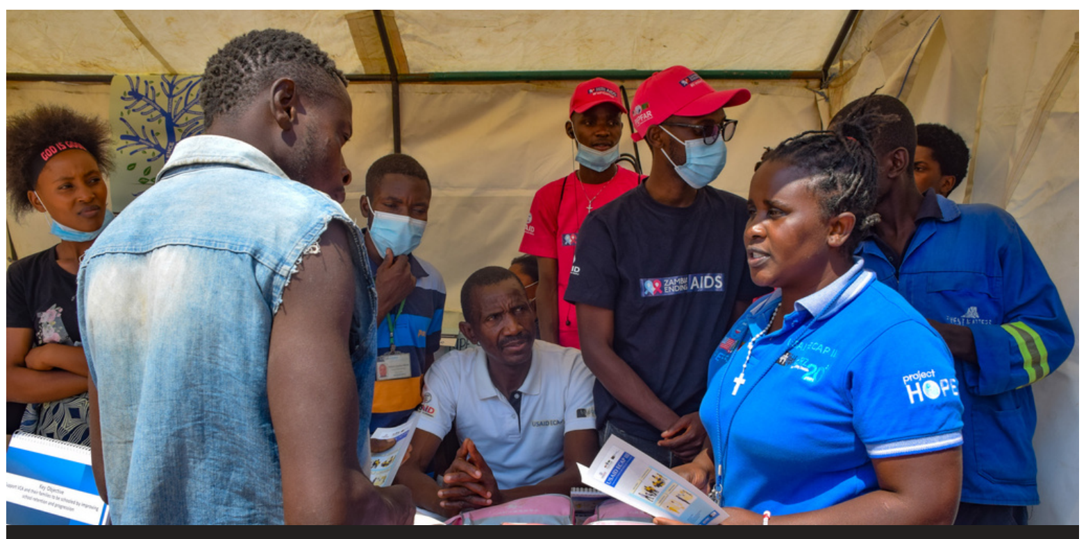
CIDRZ Staff at the 2024 HTCT commemoration in Chongwe

The Centre for Infectious Disease Research in Zambia (CIDRZ) proudly participated in the National HIV Testing, Counselling, and Treatment Day, celebrated under the theme: "Free Your Mind! Test for HIV Today! Secure Your Future."