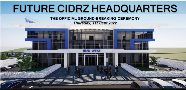
OFFICE BLOCK - 3D PERSPECTIVES