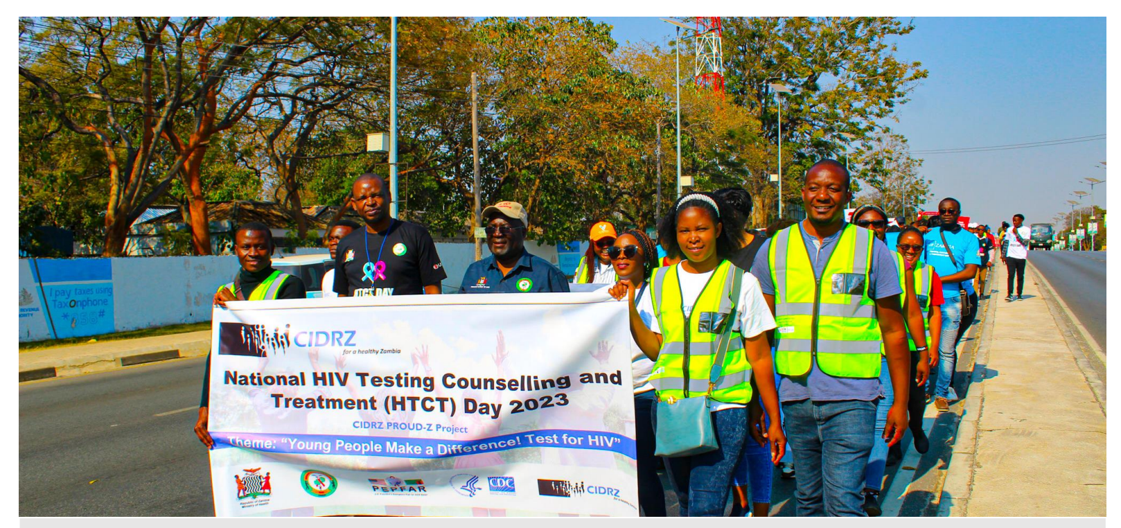
CIDRZ members of staff participate in a match past held during the commemoration of the 2023 National HIV Testing Counselling and Treatment (HTCT) Day in Lusaka

Zambia's Vice President Hon. Mutale Nalumango has called on stakeholders to help reinforce the importance of HIV testing among adolescents and young people to realise zero HIV cases by 2030.