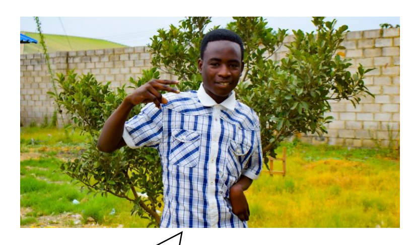
"Being given this opportunity of spreading information, spreading understanding and creating a safe environment for discussions among adolescents is a great achievement for me."

to get the information and services, they need to make healthy choices and reach their full potential. Click to Read more..