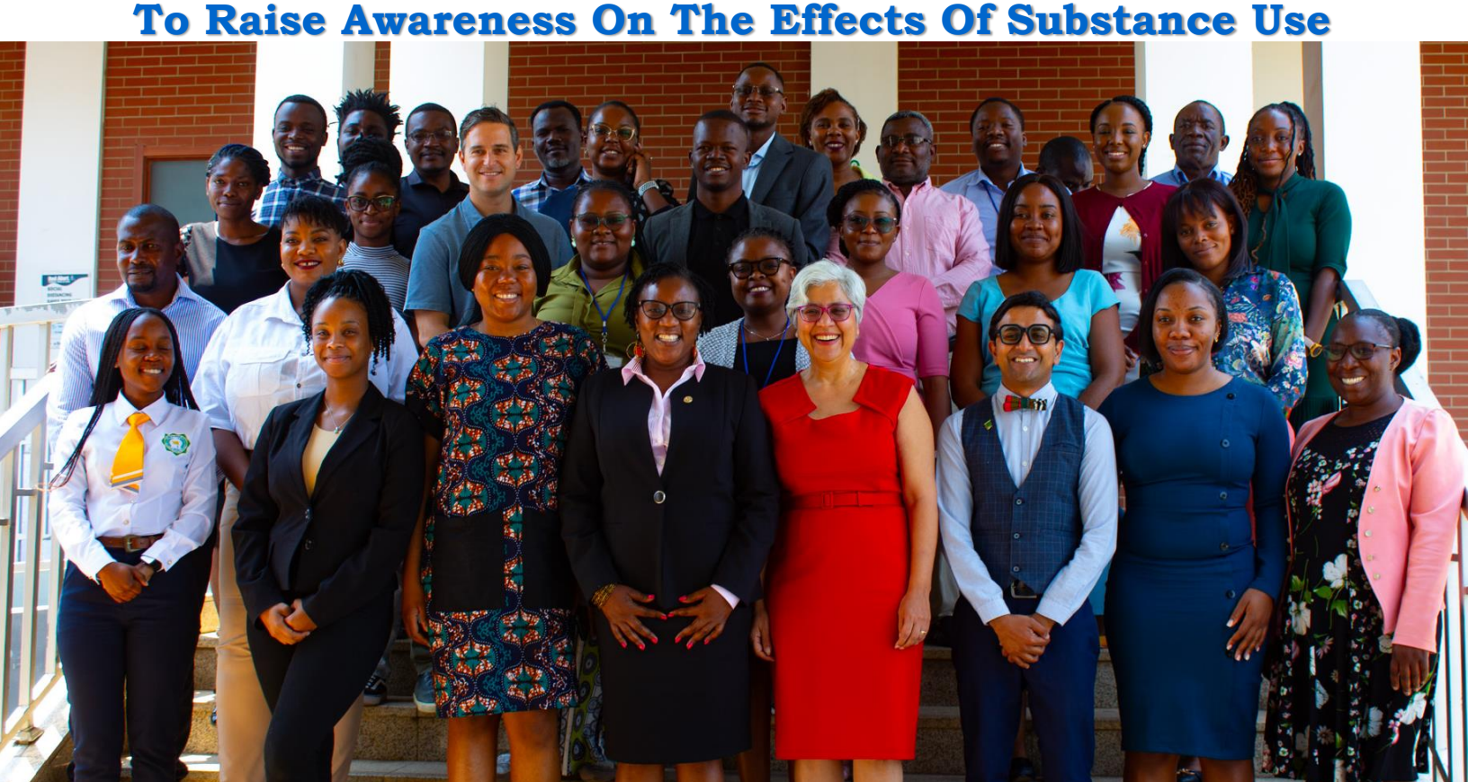
Delegates at the Substance Use Symposium held at the University of Zambia pose for a photo.

CIDRZ, In Collaboration With Several Partners Host Symposium