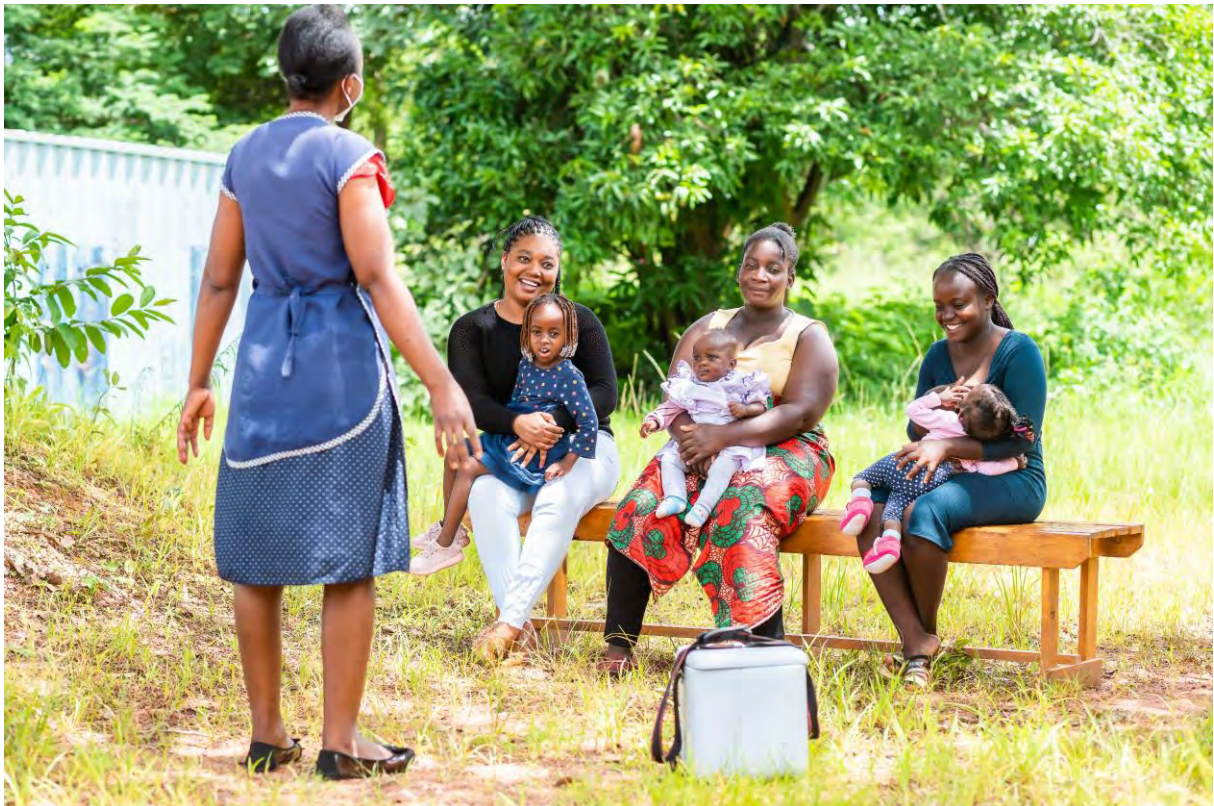
A health Worker having a health talk with young mothers.