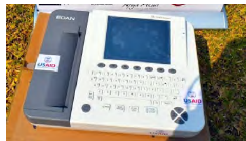
One of the donated ECG machines.