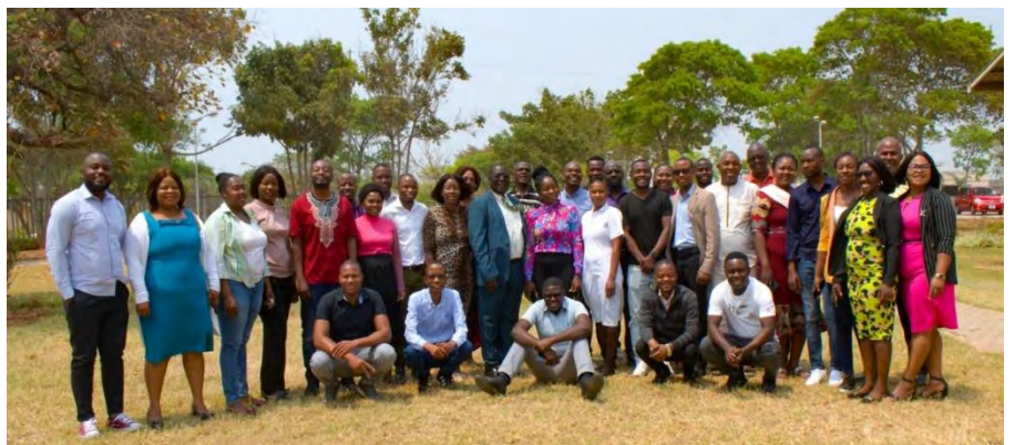
Participants pose for a photo.