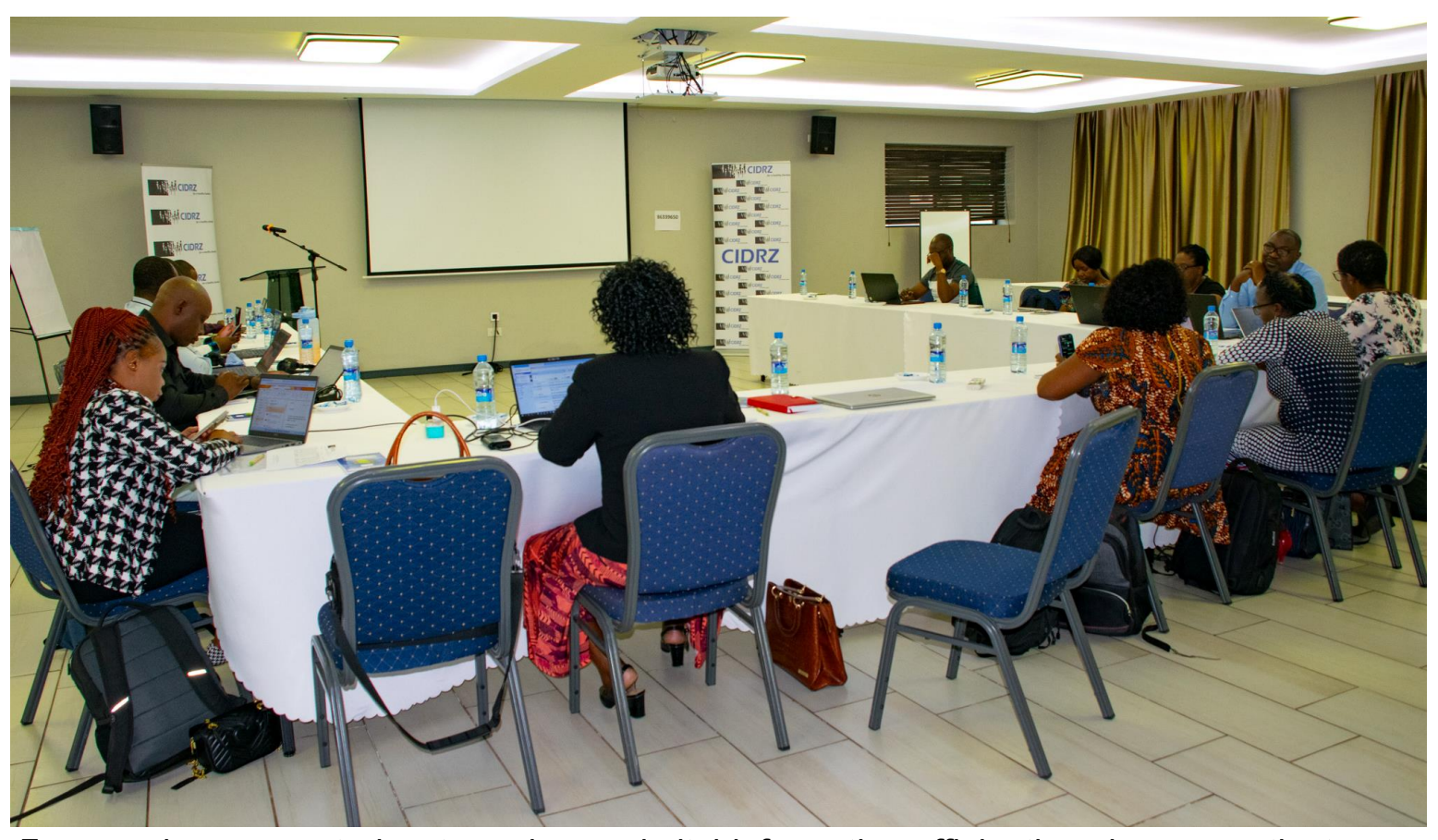
Empowering nurses to locate and record vital information efficiently enhances patient care. CIDRZ is excited to collaborate and support the Lusaka College of Nursing and Midwifery as they develop their health informatics curriculum.