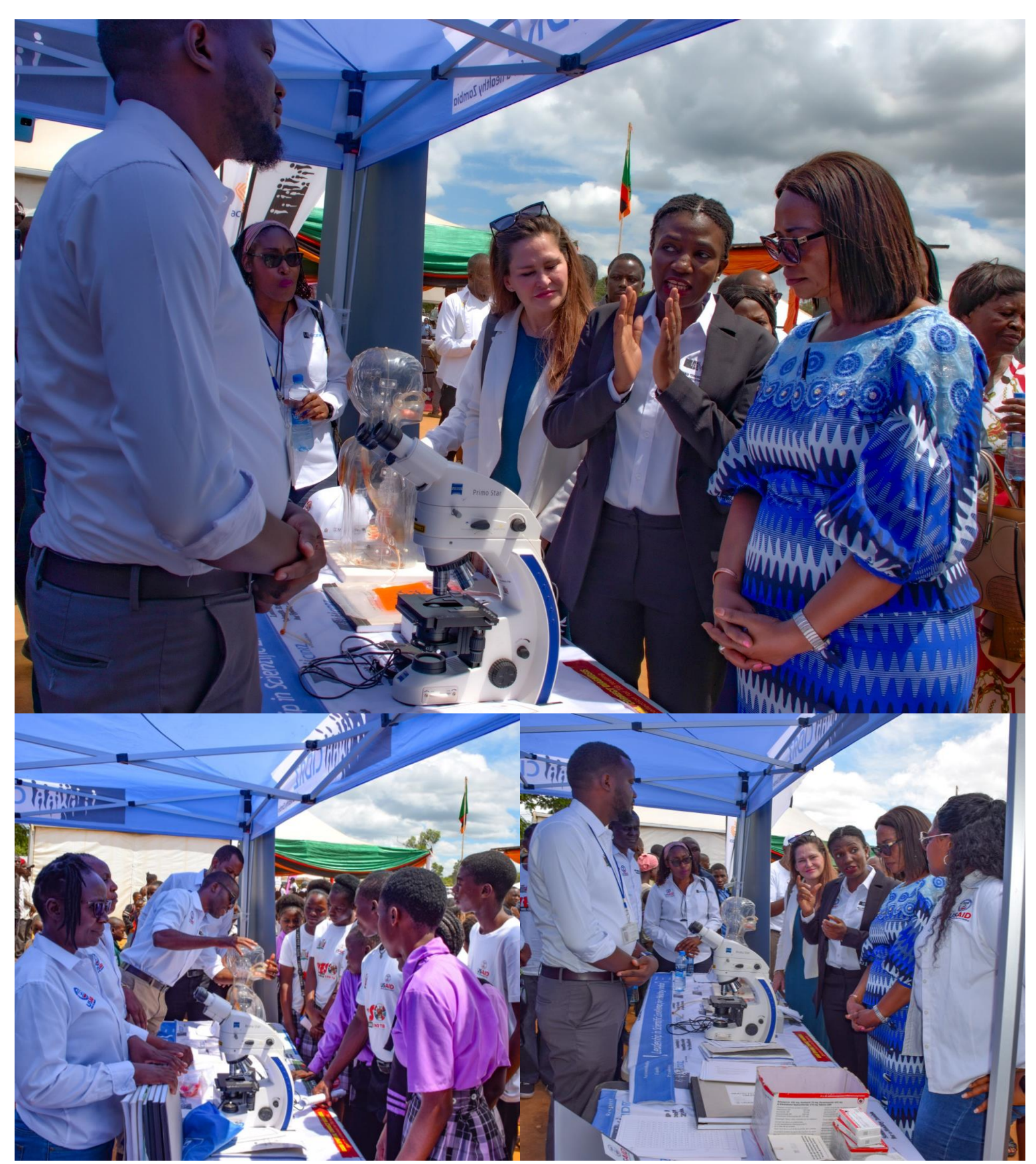
World Tuberculosis Day Commemorations Held In Kabwe, Central Province