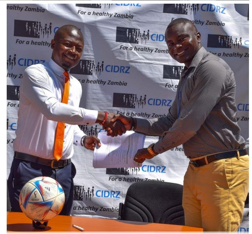
CIDRZ proudly joins the lineup for the Corporate Soccer League Zambia, look out for thrilling matches